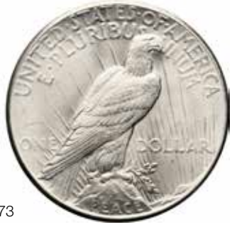
273 1926 S$1 (5) Choice to Gem Uncirculated $1,600 - 1,800