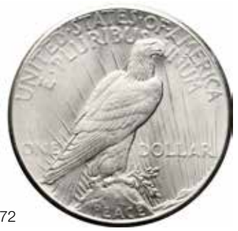
272 1926 S$1 (5) Choice to Gem Uncirculated $1,600 - 1,800